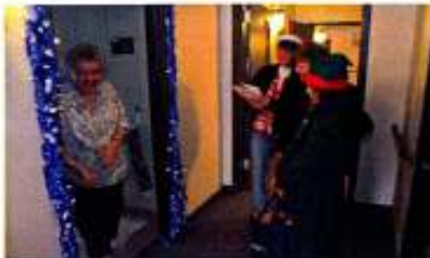
A senior happily received her Holiday Basket

"I'm so thankful for you and the kindness you've shown." - Holiday Basket recipient