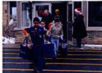
Cub Scouts enthusiastically delivered Holiday Baskets

450 Holiday Baskets were delivered to low-income, isolated seniors and adults with disabilities on December 11th by caring volunteers.