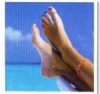
Up to 70% off Travel