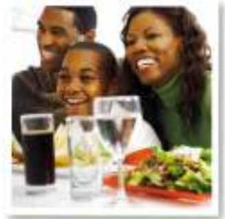
Up to 50% off Eating Out