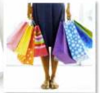
Big Savings on Shopping, Services & Entertainment